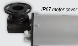
IP67 motor cover

Lofrans' designed marine anodised aluminium gearbox